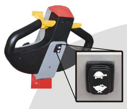
Also available in Cold Store Version -30°C