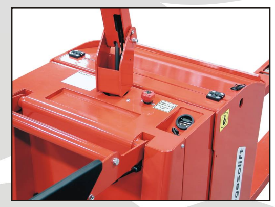
Protected instruments and shelf box